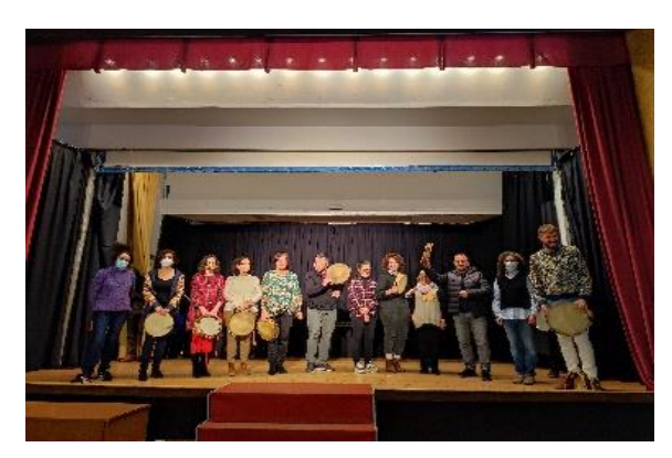
TRADITIONAL MUSIC AND DANCE from León was played and danced in the main school hall in the evening.